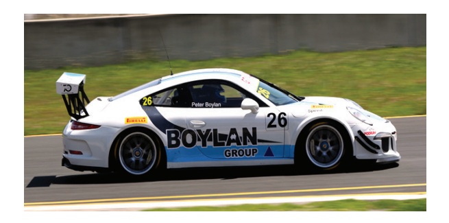
PORSCHE Challenge Older Model Carrera Cup cars

All Porsches other than FIA GT-3 models.