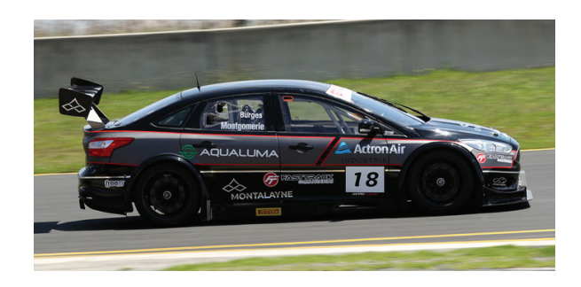
MARC Cars MARC I cars only Marc I in original Factory specifications.

2016 models and earlier only, MARC II cars and cars from all other classes.