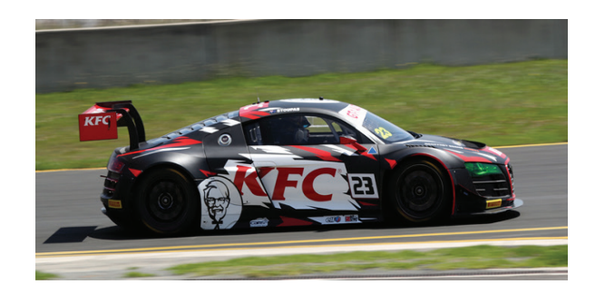
OUTRIGHT FIA GT-3 cars

2016 models and earlier only, MARC II cars and cars from all other classes.