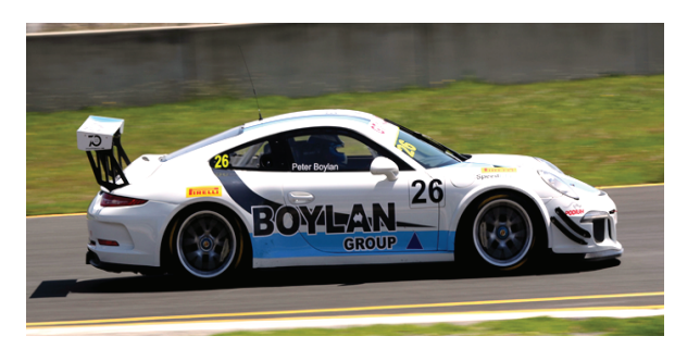
PORSCHE Challenge Older Model Carrera Cup cars

Marc I in original Factory specifications.