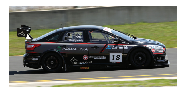
MARC Cars MARC I cars only

2016 models and earlier only, MARC II cars and cars from all other classes