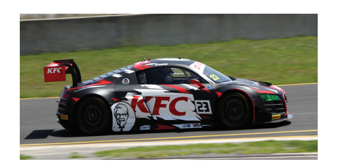
OUTRIGHT FIA GT-3 cars

2016 models and earlier only, MARC II cars and cars from all other classes