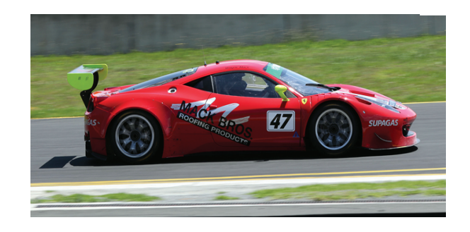
FERRARI Challenge Ferrari's other than FIA GT-3 models

All Porsches other than FIA GT-3 models.