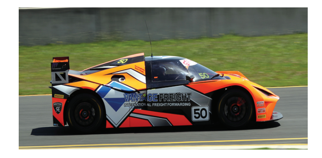
GT-4 FIA GT-4 Cars

Non gt3 cars,including F360, F430, F458, F488 challenge models.