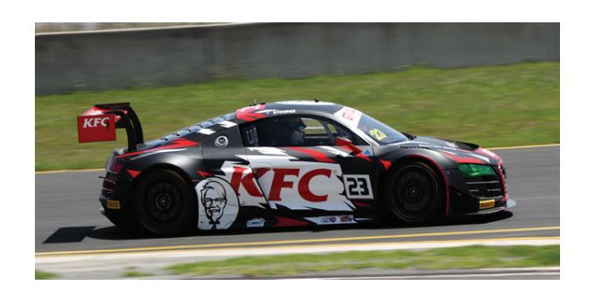
OUTRIGHT FIA GT-3 cars

2016 models and earlier only, MARC II cars and cars from all other classes.