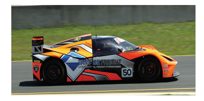
GT-4 FIA GT-4 Cars

Non GT-3 cars, including F360, F430, F458, F488 challenge models.