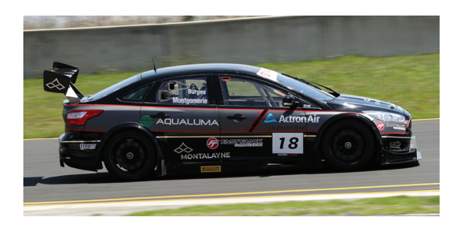
MARC Cars MARC I cars only

2016 models and earlier only, MARC II cars and cars from all other classes.