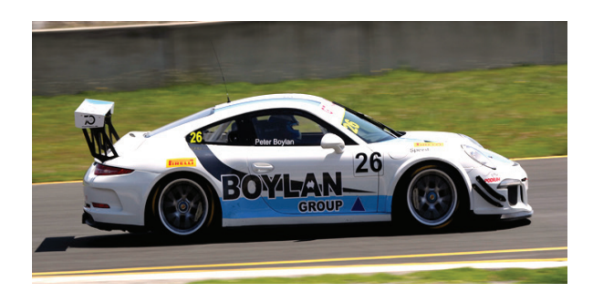
PORSCHE Challenge Older Model Carrera Cup cars

Marc I in original Factory specifications.